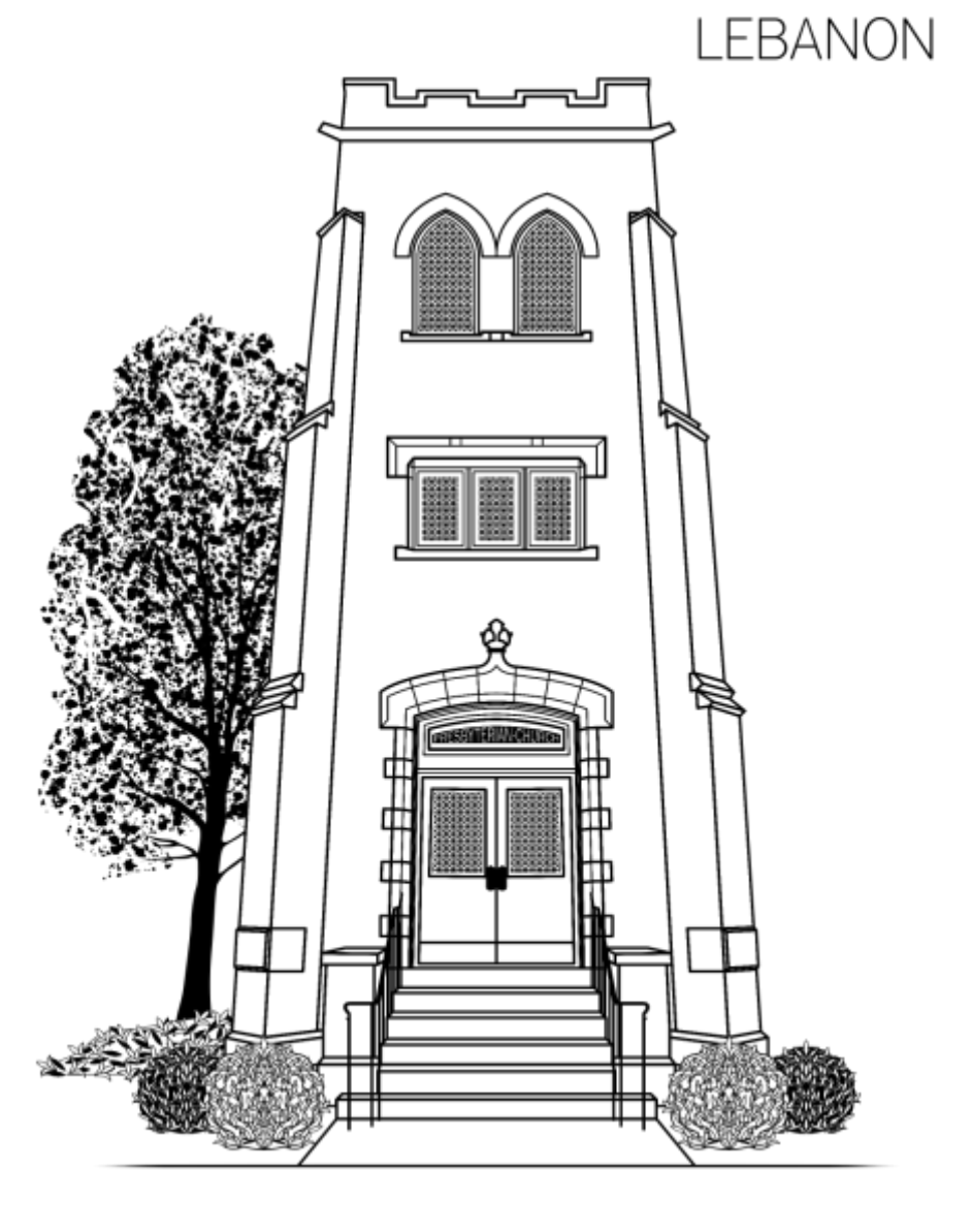
February 11, 2024